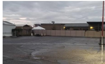
Patient Testing Site and Traffic Flow