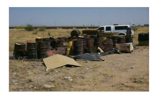
CYPRESS LANDFILL McDowell and Country Club