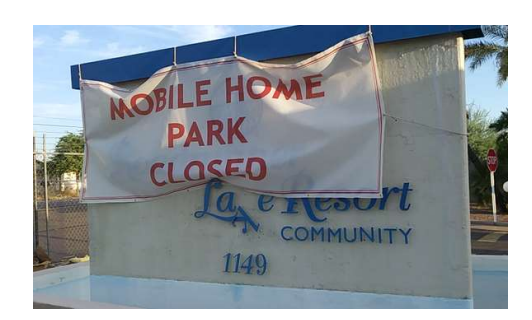
ROADRUNNER LAKE RESORT