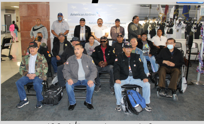
'22 Veterans Day in DC