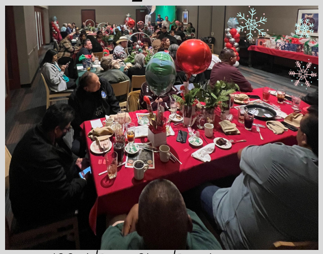
'22 Veteran Christmas Dinner