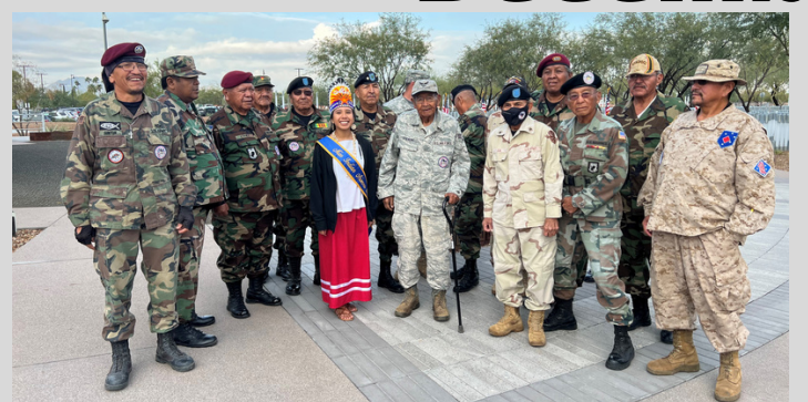
'22 Pearl Harbor Remembrance Day