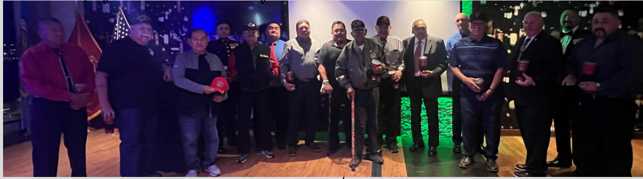
'22 Marine Corps Birthday Dinner