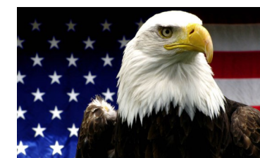
The Bald Eagle

LEARN MORE AT www.saltriverenvironmental.org