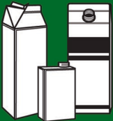
Paper Cardboard, Dairy and Juice Containers