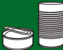
Tin or Steel Cans