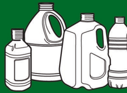
Plastic Bottles and Containers #1-7