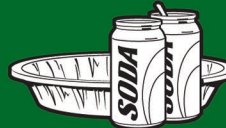
Aluminum Cans, and Pie Tins